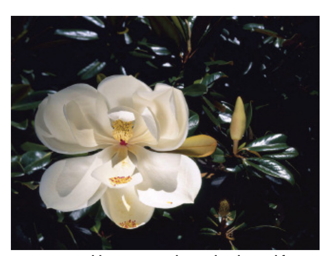
Gamble House garden, Palo Alto, California.